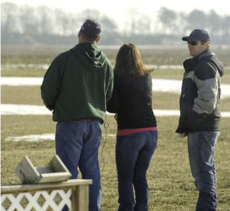
Buddy box flying on day one

32x3 ; 33x1 ; 34x1 ; 36x1 41x2 ; 44x1 ; 45x1 ; 46x2 ; 48x1 51x1 ; 52x3 ; 53x1 ; 54x2 ; 55x2 56x2 ; 57x3 ; 59 reserved