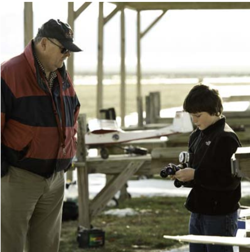
Lots of toys at the field