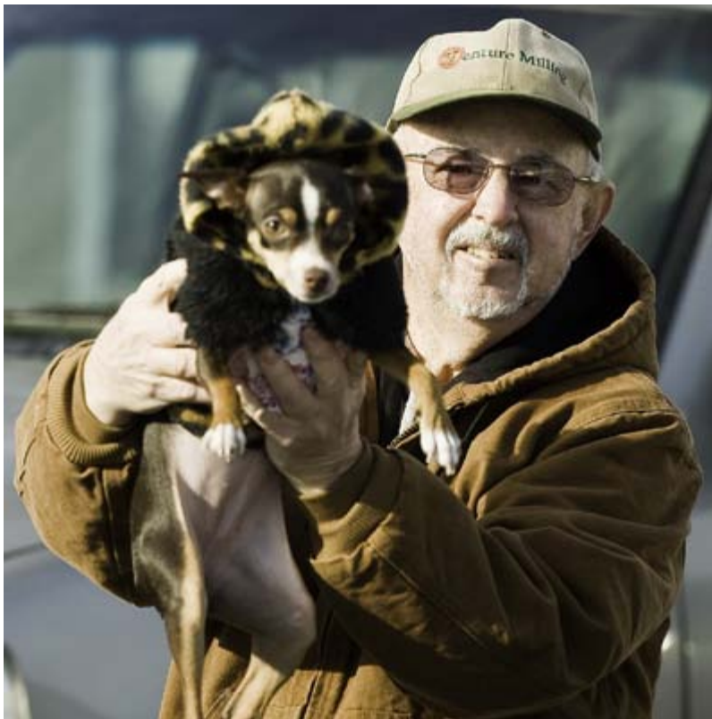
Bob's hot dog