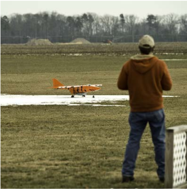
turbine snow blower