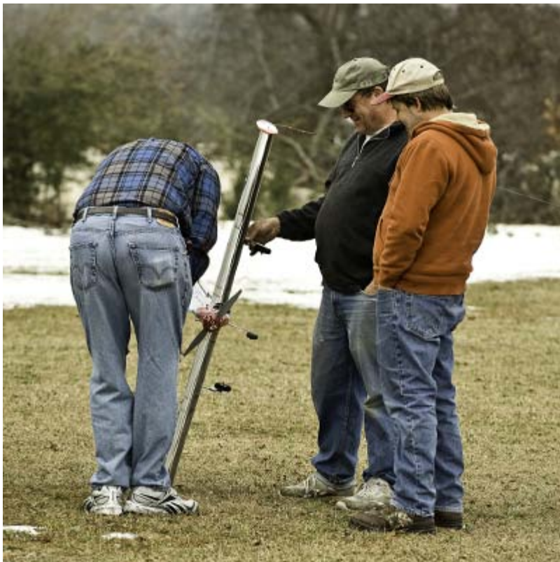
Control line guys prepare to make snow angles