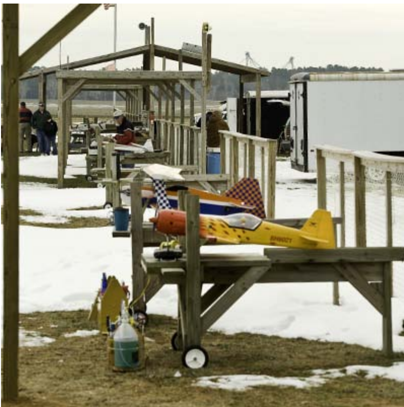
busy day at the field