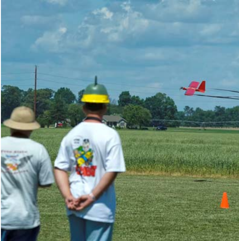
landing under power