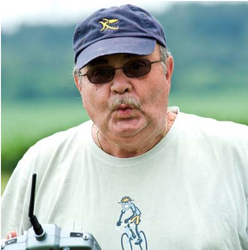
pb kiss offer