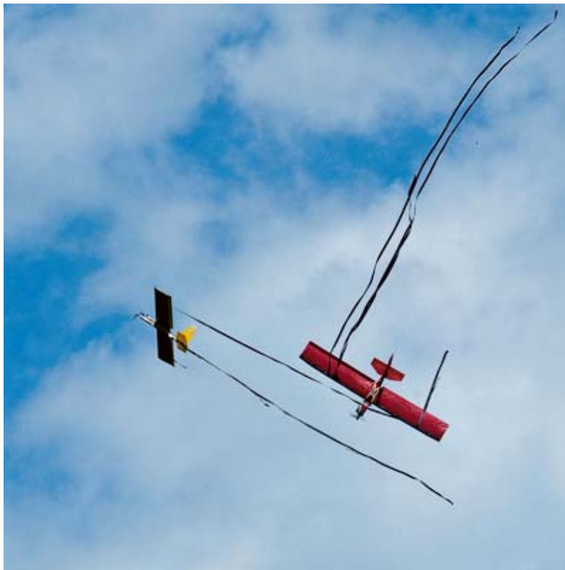
trolling for streamers