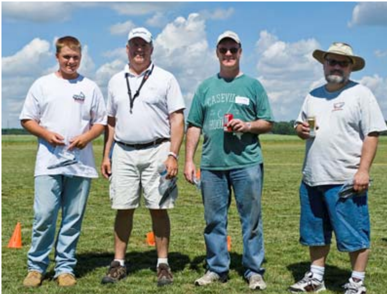
Winners Circle - Thanks guys - come back soon