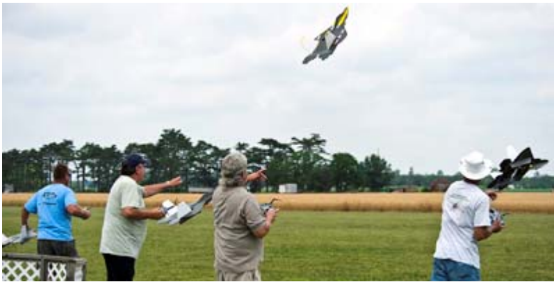
foamy jets formation take off