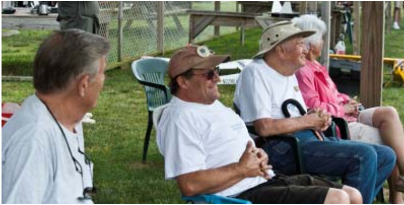
fun fly spectators