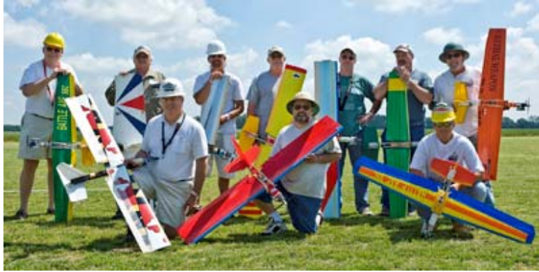
SSC Competitors before carnage